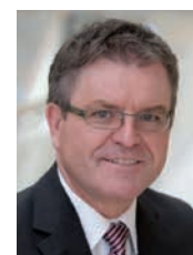
Wilhelm Haselmeier GmbH & Co. KG

You can receive in-depth advice about self-administration with injection systems by calling +49 (0) 711 71 97 90 or by sending an email to info@haselmeier.com